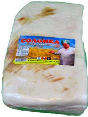
Cured Pork Fat Large Salo Solomka Vacuum Packed $12.50 / lb