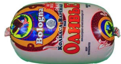
Bologna Olivie $2.99 / lb