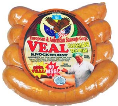
Veal Knockwurst 1 lb vacuum packed $4.25 / lb