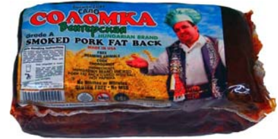
Cured Pork Fat Small Salo Solomka Hungarian Vacuum Packed $12.50 / lb