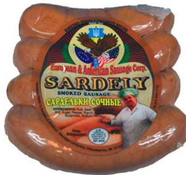
Smoked Sausage Sardeli Sochnie 1 lb vacuum packed $4.00 / lb