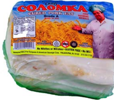
Cured Pork Fat Small Salo Solomka Vacuum Packed $12.50 / lb